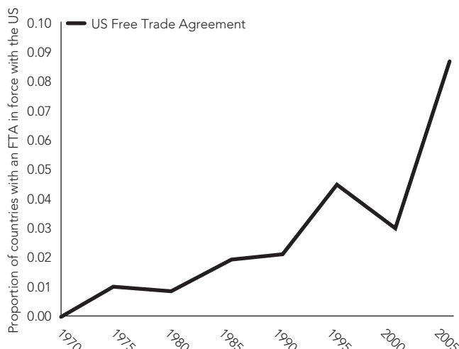
Figure 3 Proportion of countries with a free trade agreement in force with the US over time

or Figure 2). Openness as reflected by the number of free trade agreements with the United States has also been increasing since the 1970s. Pre-1990, few, if any, countries had a free trade agreement in force with the USA. By 2005, 9 per cent of the sample had a US free trade agreement in force (see Figure 3).